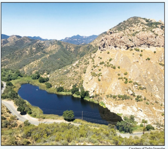
CRYSTAL BLUE—Created in 1889, the dam for this body of water is reputed to be the first concrete dam in California. Editor's note: The Acorn is teaming up with the Conejo Open Space Foundation to offer our readers a special challenge: Name that open space. Thousand Oaks includes over 40 open space areas, each with qualities and features all its own. Every two weeks, COSF will provide a photo and a clue. Submit your answer to the COSF Acorn Photo Contest landing page at cosf.org/where-conejo within one week of publication. The winner will receive a $25 gift card. If there are multiple correct entries, a winner will be chosen through a blind random process. Winners will be notified by email and identified with the next photo posted in the Acorn.